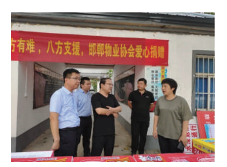
Charity donation activity