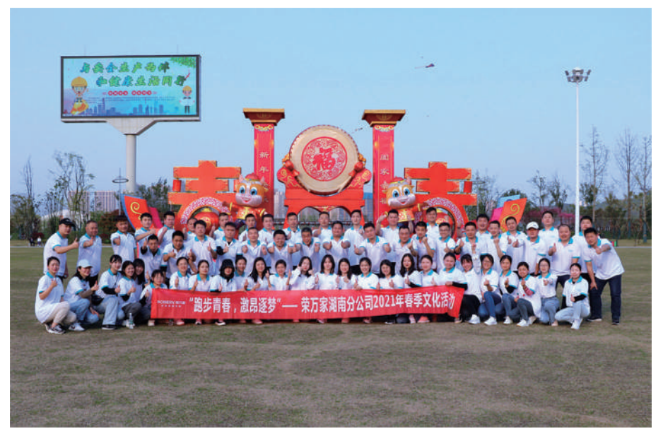
"Run for Dreams" Cultural Event

The Group actively organises employee activities, including traditional festival celebrations, team building, corporate culture building, welfare and care, to enrich the employees' leisure time.